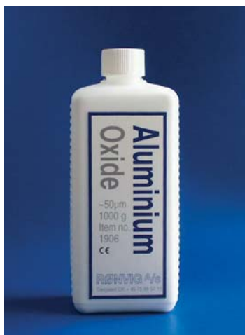
1 Kg Aluminium Oxide 50 µm. Item No. 1906

The Spray Tip is not covered by the warranty. This part is made of hard metal, which is the best suited material for the purpose, since it resists the wear of the abrasive. However, hard metal is also very brittle and the spray tip might break if the unit tumbles down.